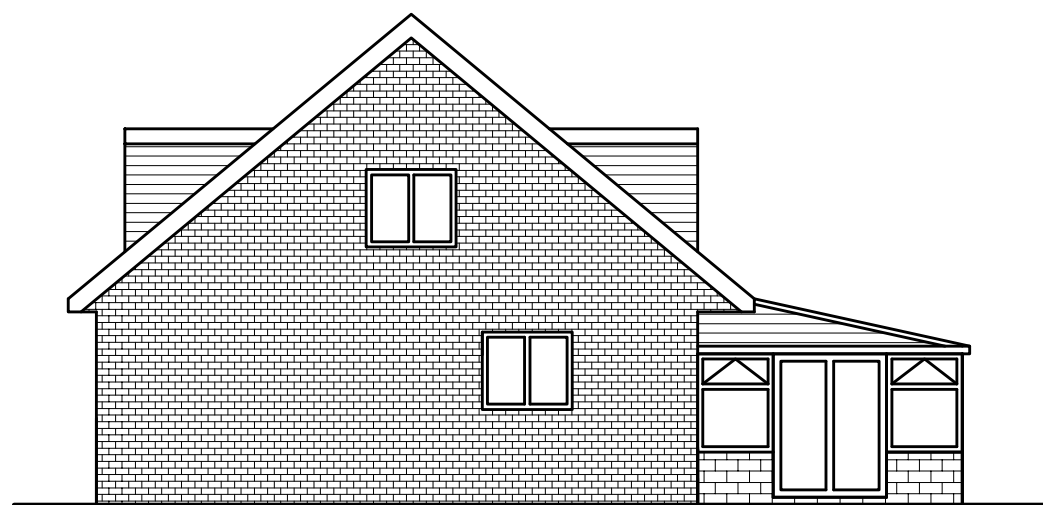
SIDE ELEVATION AS PROPOSED (1:100)