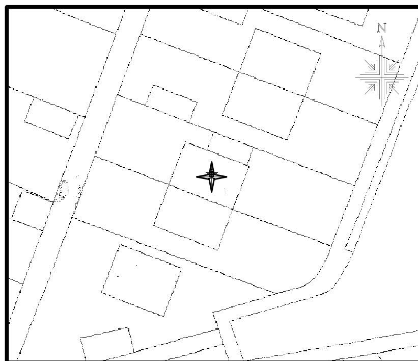
PLAN VIEW (1:500)