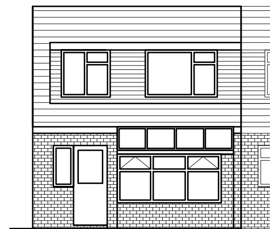
REAR ELEVATION AS PROPOSED (1:100)